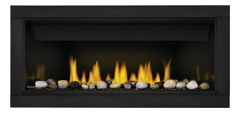
Classic Black Surround