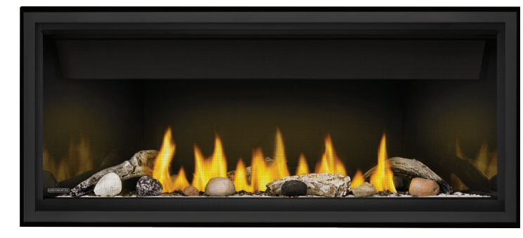
Standard Safety Barrier